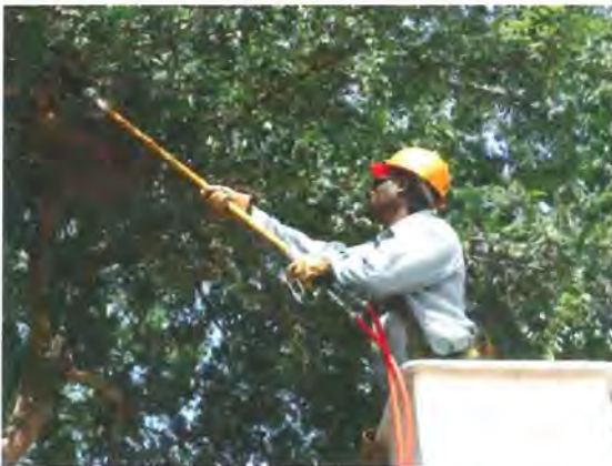
The City of Novi contracts with Asplundh Tree Service to prune street trees and handle on-call emergency tree services throughout the entire growing season.

Design and planning for seasonal plantings is undertaken by the Community Development Department, in partnership with the Public Services' Forestry Division. Bids are taken from numerous local landscape firms to obtain the best pricing. Throughout the planting period, City staff works closely with the contractor to appropriately locate the trees and to ensure proper installation.