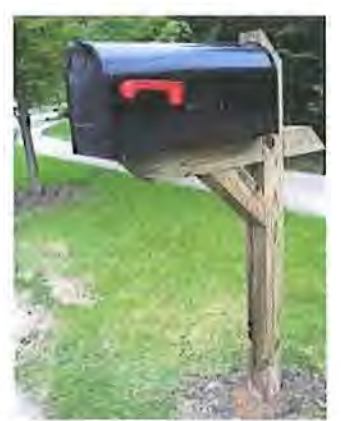
Figure 1 – Example of Standard USPS Mailbox/Post