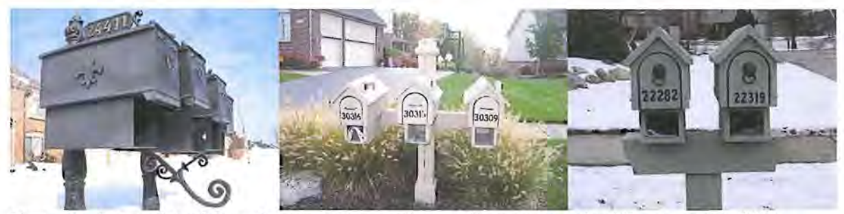
Figure 2 - Examples of Non-Standard Decorative Mailboxes Repaired/Replaced in 2011

DPS staff queried several Michigan communities (including the cities of Livonia, Farmington Hills and Sterling Heights, and Bloomfield Township in southeast Michigan) and found that none have adopted a practice similar to Novi's – especially as it relates to the repair/replacement of non-standard units. Instead, most communities have policies that call for installing a standard USPS mailbox and post, providing a flat reimbursement amount to the property owner, or allowing the owner to choose one of these two options. Policies such as these not only minimize costs, but they also reduce the number of hours spent by City crews that could otherwise be dedicated to preventive maintenance of roads and drains.