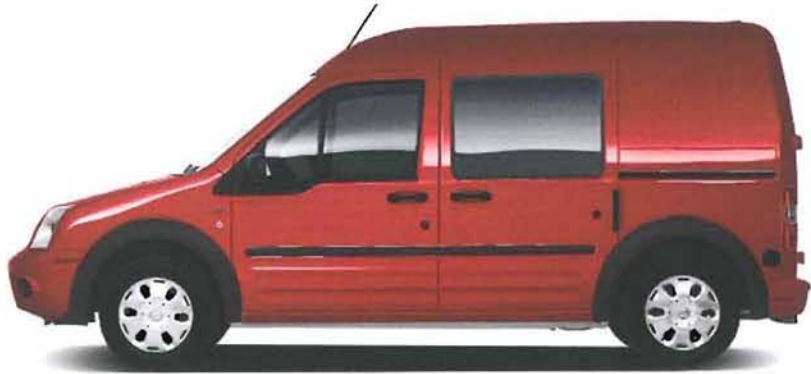
2012 Ford Transit Connect Cargo Van