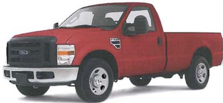
2012 Ford F-250 / F-350 Regular Cab Truck