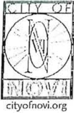
EXHIBIT A FEE PROPOSAL CITY OF NOVI