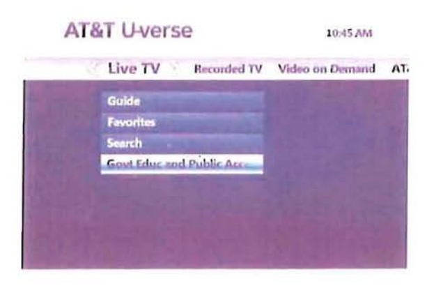
Description, Sample A1&1 U-verse Main Menu - Live TV

When an AT&T U-verse subscriber selects the channel number corresponding to the PEG application, it will launch and become activated. Next, a list of the various cities offering PEG content will be presented to the end user as illustrated below: