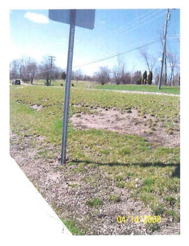
Twelve Mile East of Novi Road (View West)