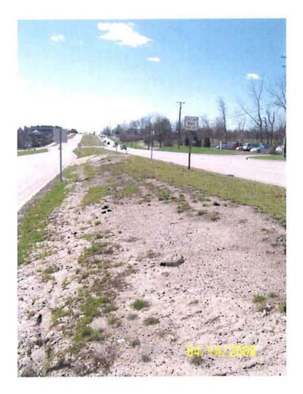
Twelve Mile East of Novi Road (View West)