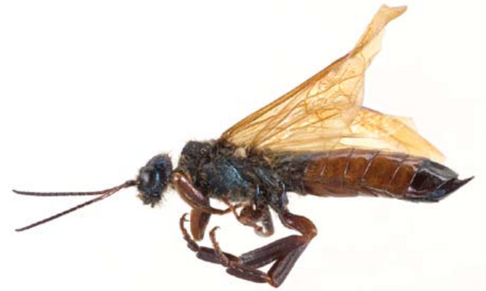
Figure 2. Sirex noctilio —adult male.