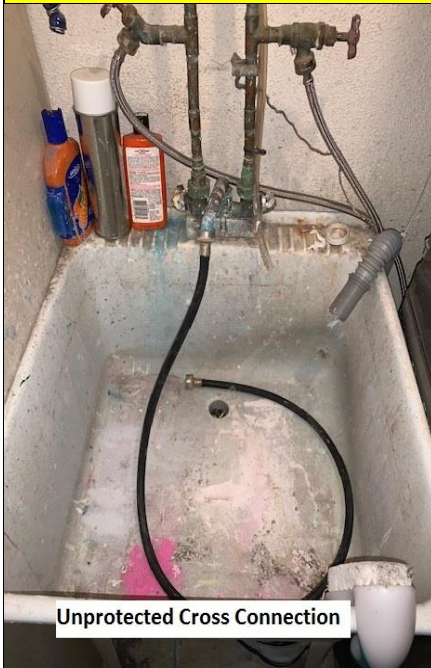
Unprotected Cross Connection