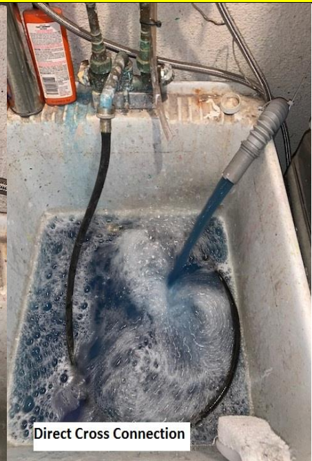
Direct Cross Connection