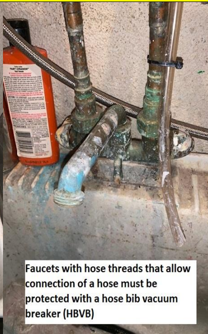
Faucets with hose threads that allow connection of a hose must be protected with a hose bib vacuum breaker (HBVB)