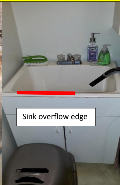
Sink overflow edge