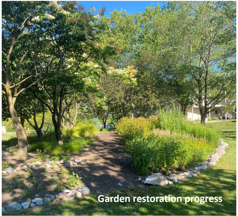
Garden restoration progress